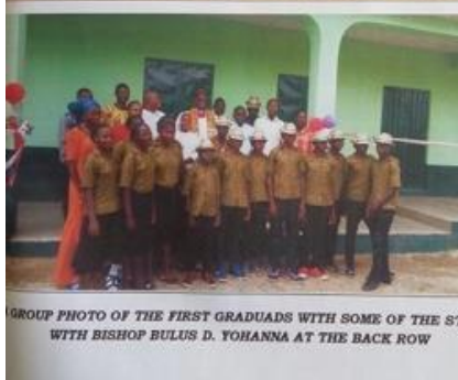
GROUP PHOTO OF THE FIRST GRADUADS WITH SOME OF THE ST WITH BISHOP BULUS D. YOHANNA AT THE BACK ROW