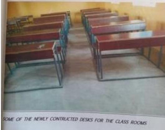
SOME OF THE NEWLY CONSTRUCTED DESKS FOR THE CLASS ROOMS