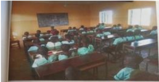
PUPILS RECEIVING LESSONS IN THE NEW CLASS ROOM BLOCK